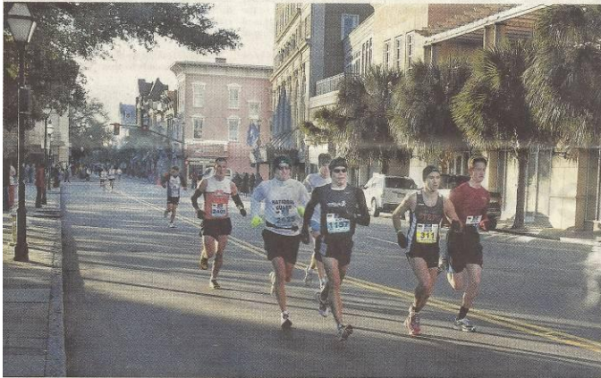
The first Riverfront Race Festival's Charleston Marathon took place Saturday, starting near the South Carolina Aquarium in Charleston, heading down East Bay Street and circling The Battery before heading up King Street to North Charleston. It was the first marathon in the Holy City since the Bridge-a-thon was held in October 1985. Race officials said 1,019 runners registered for the Charleston Marathon and that 771 runners crossed the finish line. The race began with thermometer readings in the upper 20s in downtown Charleston and ended with temperatures reaching into the 40s in North Charleston. For complete race coverage, see