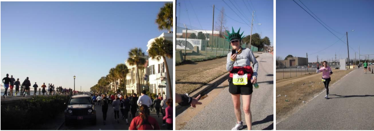
Some of my course pictures