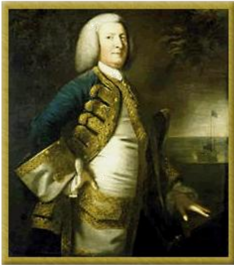
Admiral George Anson

Development/Background - Originally a three-story stationer's warehouse (circa 1901), the building was designed for individual condominium units. As a result our suites are larger than most hotel rooms. They range from 450 to 750 SF, which is unlike the typical 288 SF hotel room. Following the original renovation, the Ansonborough Inn has been transformed into this charming all-suite inn rivaling any in the South. Exposed heart pine beams and local fire red brick were commonly used in buildings of the period and these elements were incorporated in the décor throughout the Inn.