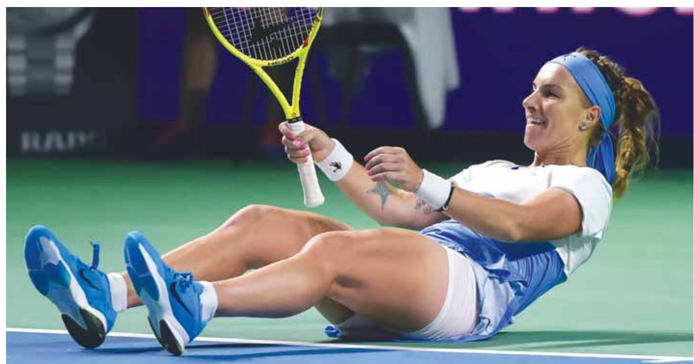
Russia's Svetlana Kuznetsova celebrates after defeating Australia's Daria Gavrilova during the Kremlin Cup tennis tournament final in Moscow.

The Russian made her return to the court for the first time since receiving the ban for testing positive at the Australian Open in January in a light-hearted exhibition featuring Martina Navratilova and John McEnroe in aid of the Elton John Aids Foundation in Las Vegas last week.