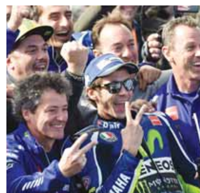
Movistar Yamaha MotoGP's Italian rider Valentino Rossi celebrates after the race.