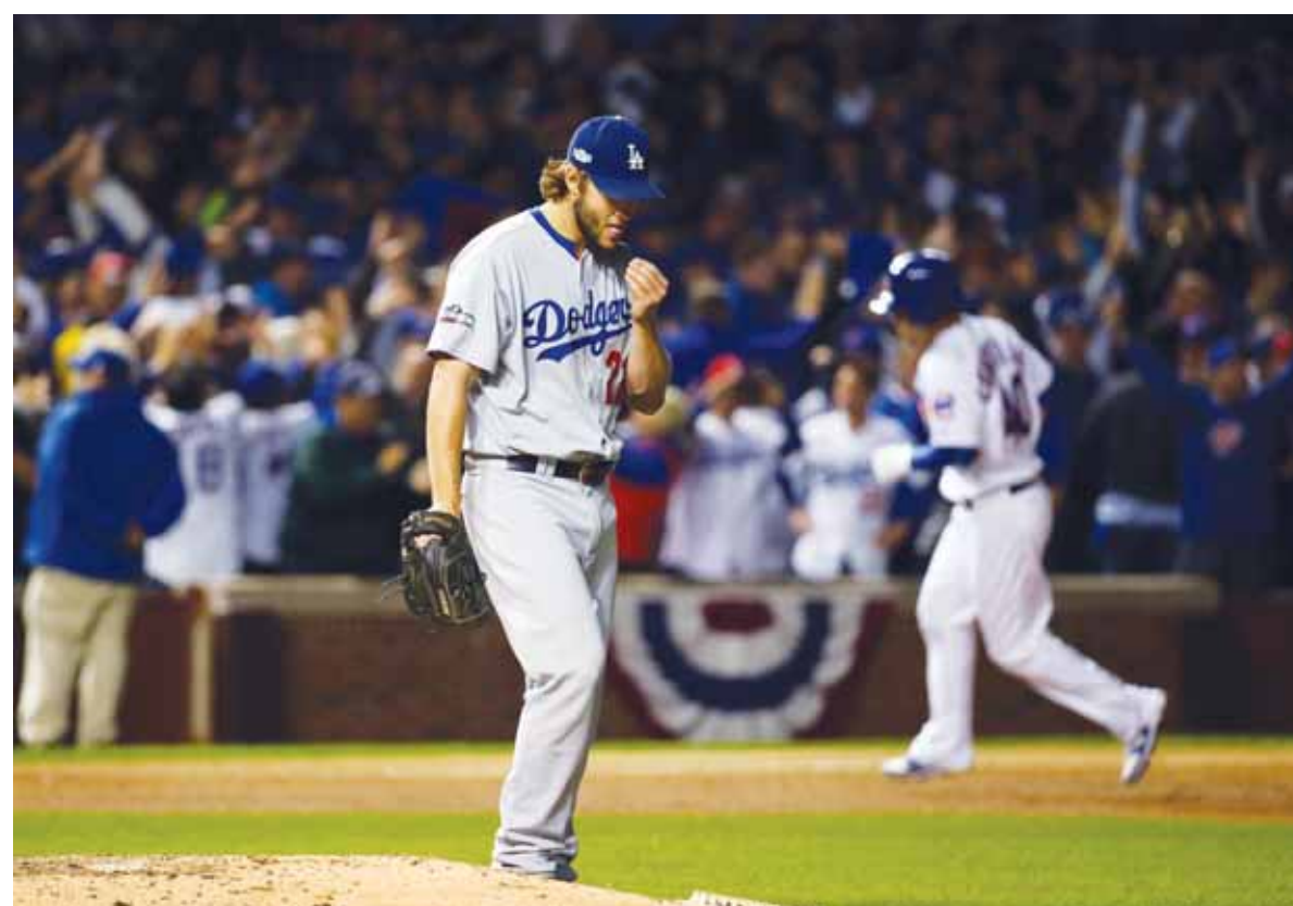
LA Dodgers' starting pitcher Clayton Kershaw reacts after giving up a solo home run to Chicago Cubs' Willson Contreras during the fourth inning of game six of the 2016 NLCS playoff baseball series in Chicago on Saturday.

That sort of self-assured rhetoric certainly didn't extend to the tense crowd at Chavez Ravine on Wednesday. The vibe was nervy and joyless, one of expected defeat rather than impending victory. The rally towels they gave us walking into the park were used less to intimidate the opposing team and more