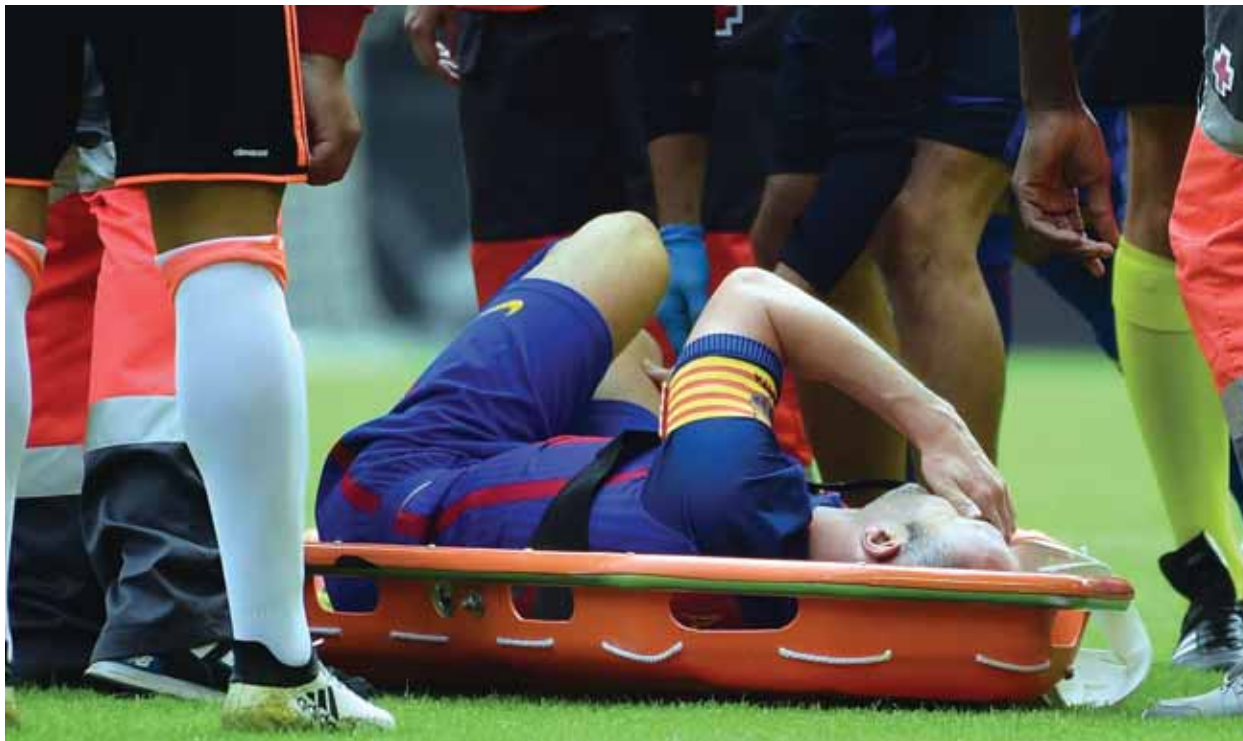
Barcelona's Andres Iniesta lies on a stretcher after being injured during the match against Valencia on Saturday.