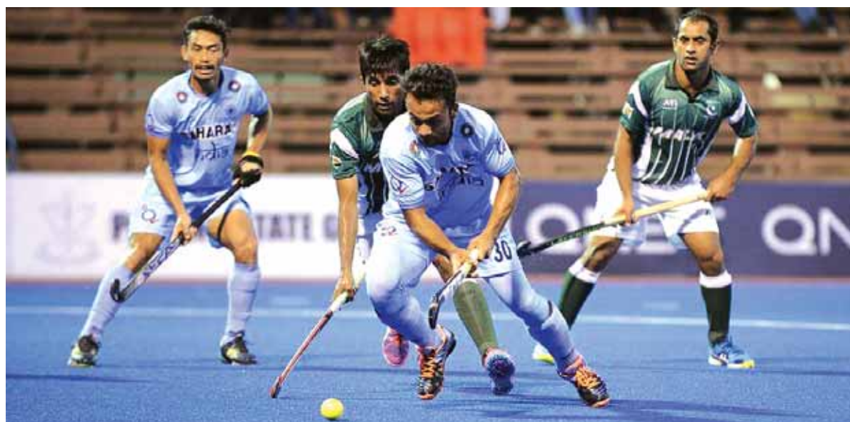
India are second in the table with seven points from three matches, behind hosts Malaysia.