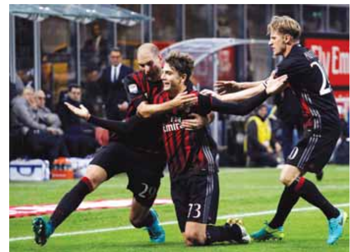
AC Milan's Manuel Locatelli (centre) celebrates with his teammates Gabriel Paletta (left) and Ignazio Abate after scoring.

He walked away from the club last year after a dispute with owner Andrea Della Valle, but has returned to Italy's top flight on a mission. After a bumpy start, the 42-year-old has transformed the hopes and dreams of a club that has been on a roller-coaster ride since even before Allegri, who led Milan to their last league title in 2011, was sacked in the wake of a stunning defeat to Sassuolo in January 2014.