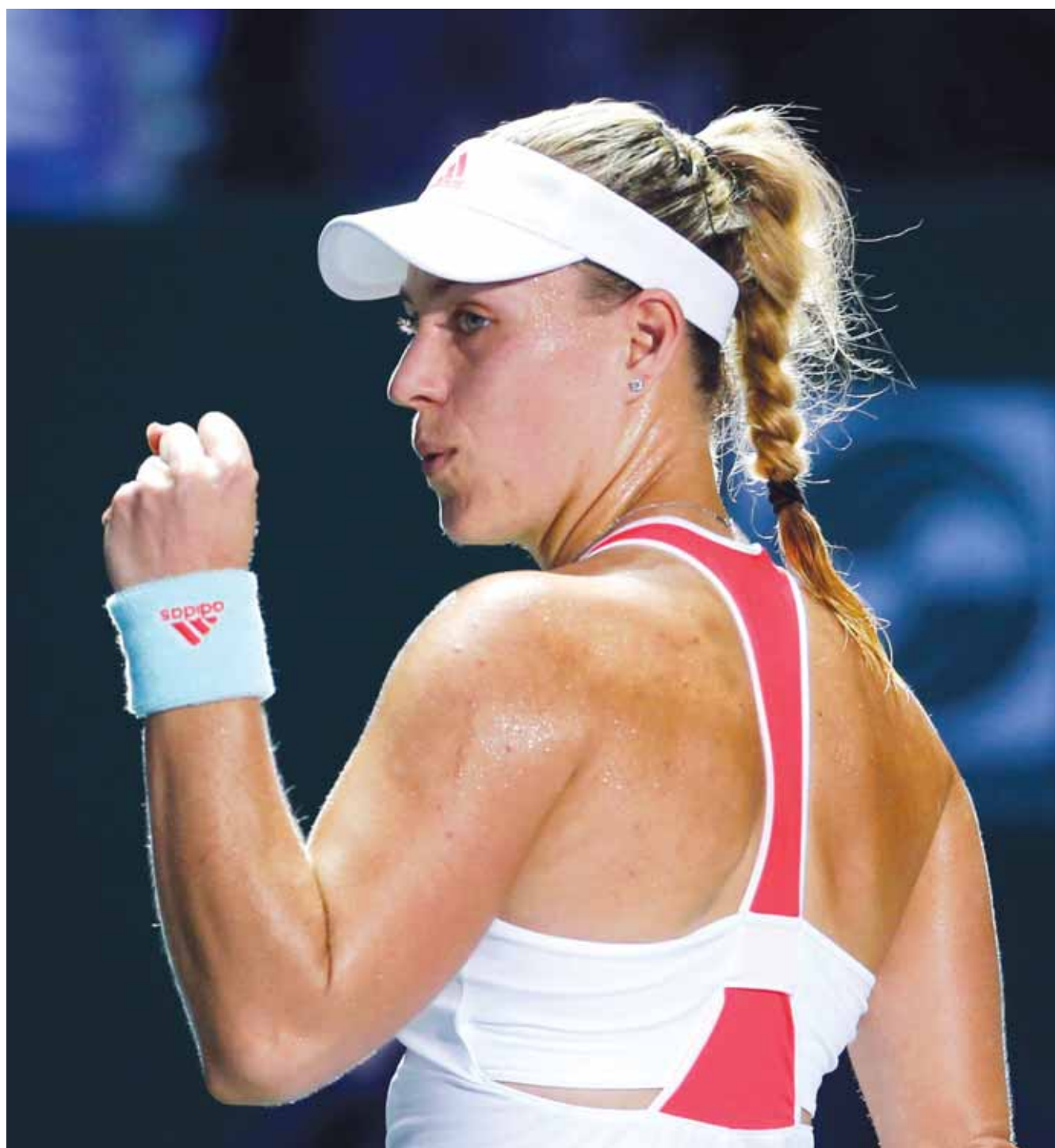
Angelique Kerber of Germany celebrates after defeating Dominika Cibulkova of Slovakia yesterday.

With exhaustion kicking in and the points growing shorter, Kerber recovered after suffering an early break and showed the class befitting the world's top-ranked player to reel off four straight games on her way to a hard-fought victory.