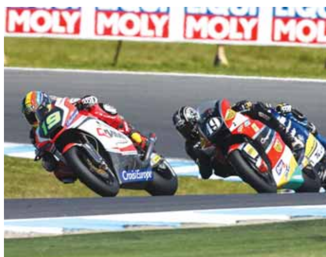
QMMF rider Xavier Simeon (left) in action during the Moto2 race in Australia yesterday.

QMMF Racing Team rider Xavier Simeon battled his way to a hard-fought eleventh place in the Australian Grand Prix. The 27-year-old from Belgium started well from 20th place on the grid and held 15th place after one lap, then gained positions steadily until he broke into the Top Ten of the Moto2 field on the ninth lap. With a little more top speed on the main straight, he could have gained even more positions, but Simeon found it difficult to attack out of the slipstream. In the end, he beat current world champion Johann Zarco, who finished in 12th place, but crossed the line just fractions of a second behind Frenchman Xavi Vierege and German Marcel Schroetter.