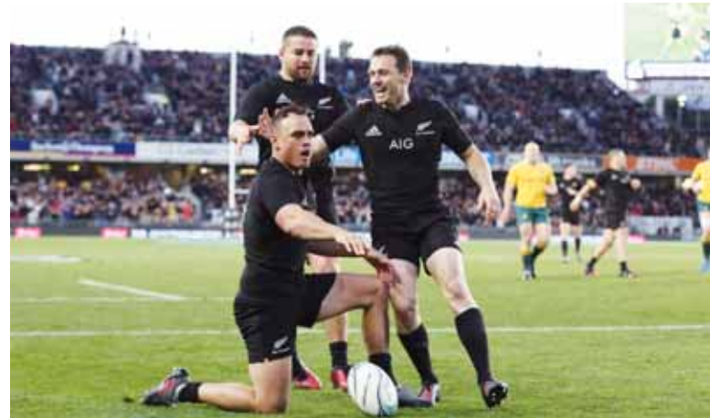
New Zealand's Israel Dagg (foreground) celebrates a try with teammates Dane Coles and Beauden Barrett (right) during the third rugby Test against Australia at Eden Park in Auckland on Saturday.

Jordie Barrett, the 19-year-old younger brother of 46-Test fly-half Beauden Barrett, has been named as