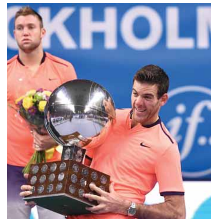
Juan Martin Del Potro reacts as he lifts the heavy trophy during an award ceremony after defeating USA's Jack Sock at the ATP Stockholm Open final in Stockholm yesterday.

"But, wow, to beat Petra in the final? That's the best moment in my life, I think."