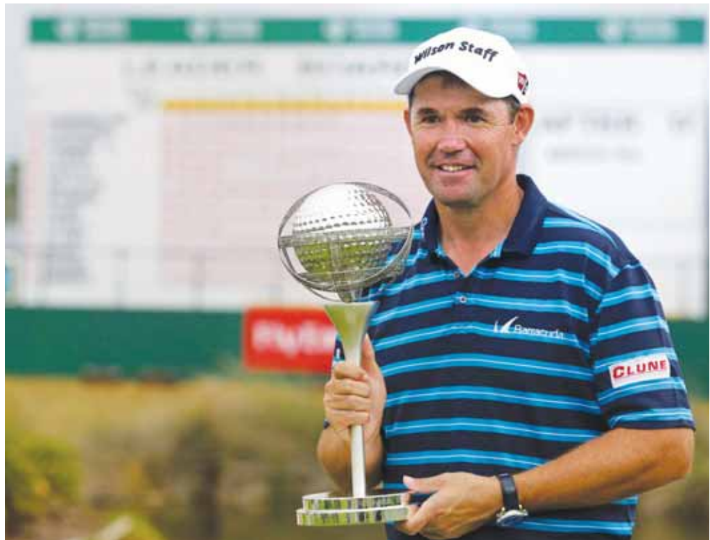
Irish golfer Padraig Harrington holds his trophy after winning the Portugal Master at Oceanico Victoria golf course in Vilamoura yesterday.