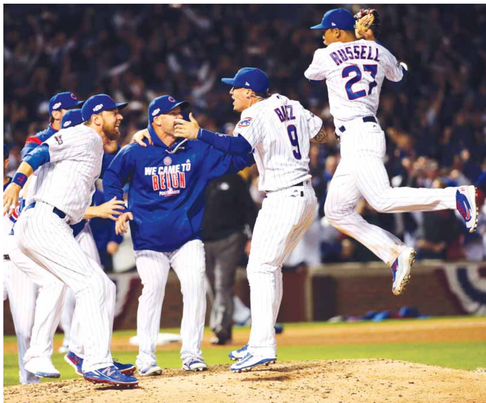
Chicago Cubs second baseman Javier Baez (second from right) and shortstop Addison Russell (right) celebrate with teammates after defeating the Los Angeles Dodgers in game six of the 2016 NLCS playoff baseball series at Wrigley Field in Chicago on Saturday.

Like the Boston Red Sox, who battled the so-called "Curse of the Bambino" after trading away legendary slugger Babe Ruth in 1920 to their arch rival New York Yankees, the Cubs have their