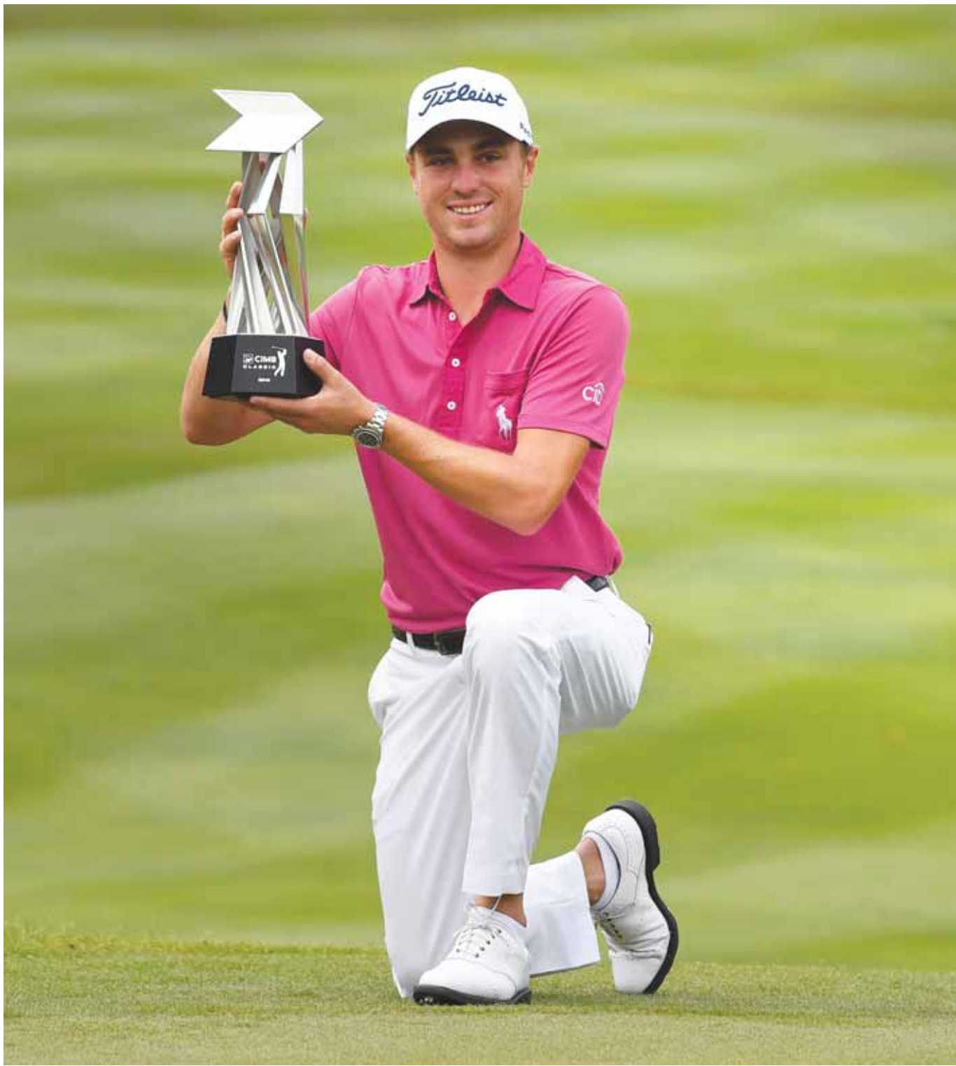
Justin Thomas of the US poses with his trophy after winning the 2016 CIMB Classic golf tournament in Kuala Lumpur yesterday.

Thomas managed to keep his challengers at bay with some solid scrambling after the turn before an exquisite approach from 108 yards set up birdie on 16. He moved four clear of the field when he sank a monster