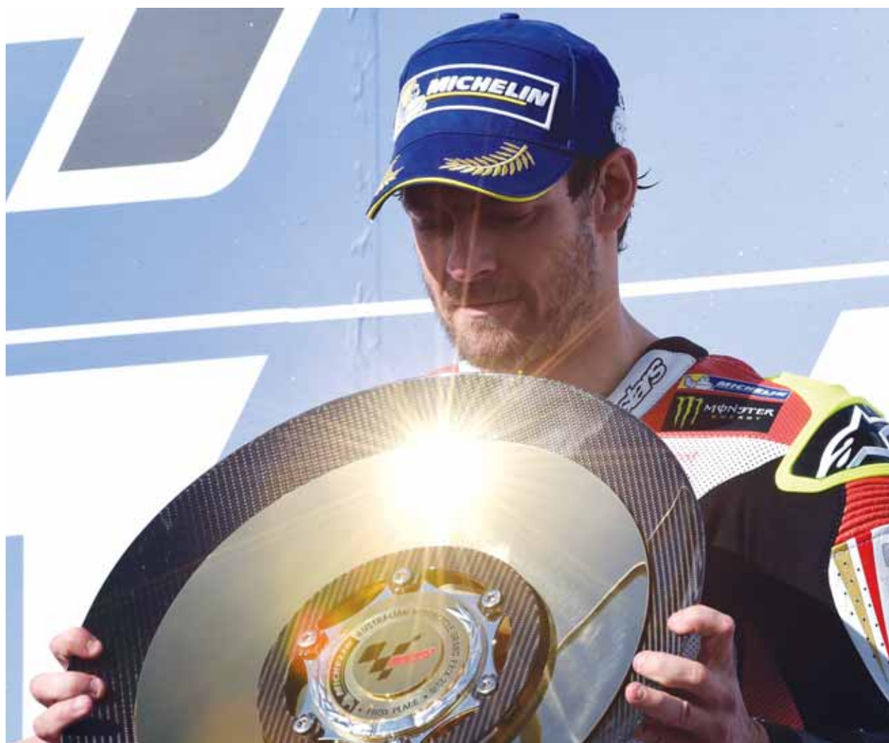
British rider Cal Crutchlow celebrates his victory on the podium after the MotoGP race at the Australian Grand Prix at Phillip Island.

"I was confident I could have won with Marc in the race and we now look forward