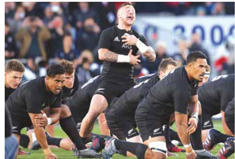
New Zealand's TJ Perenara (centre) performs the haka during the rugby Test against Australia at Eden Park in Auckland on Saturday.