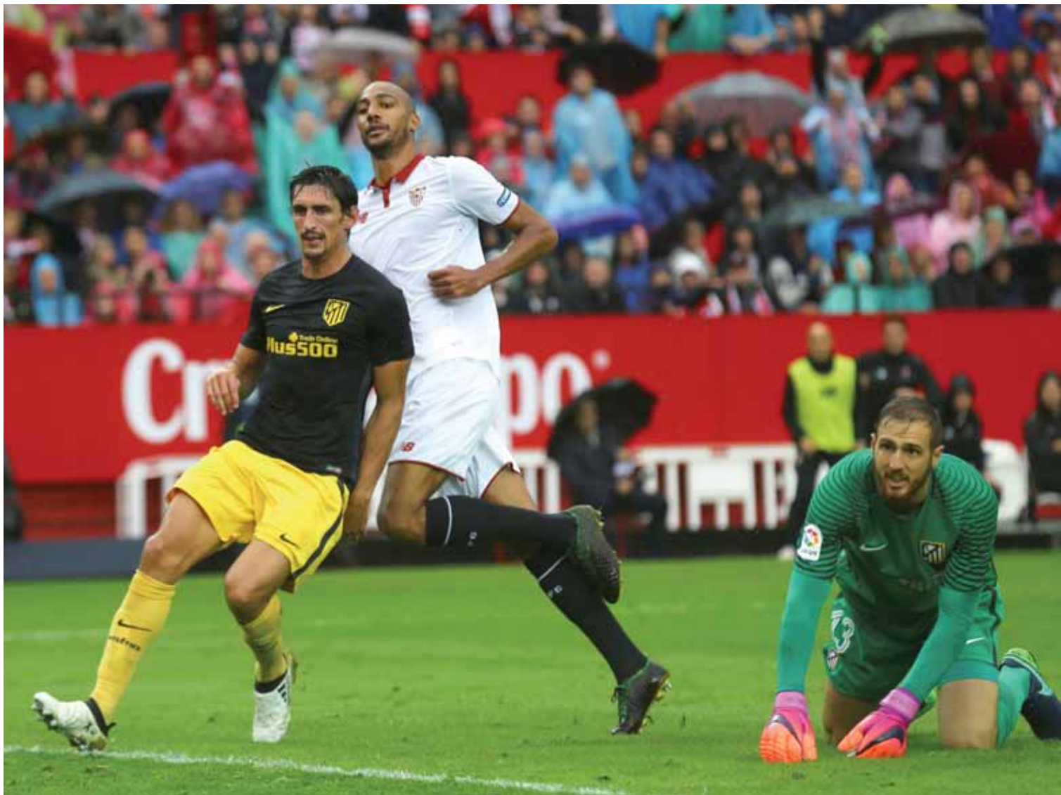
Sevilla's Steven N'Zonzi (centre) reacts after scoring against Atletico Madrid during the Spanish La Liga at Sanchez Pizjuan stadium in Seville.

Diego Godin could still have rescued a point for